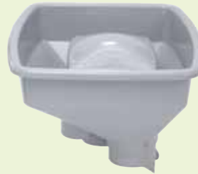
Hopper feed head

An easy solution for making large amounts of top-quality, flavoursome mashed potato.